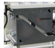
2 Measuring element PSW-1