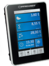
1 Weighing electronics