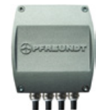
3 Inclination measuring system