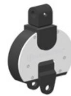
2 Measuring element KRW-2