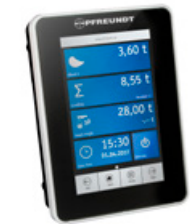
1 Weighing electronics