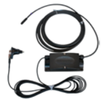
3 Radio modul