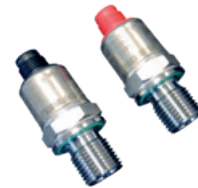
2 Pressure sensors