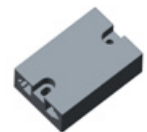
3 Inclination sensor