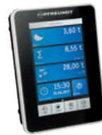
1 Weighing electronics