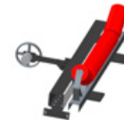
2 Weighing frame BW-2