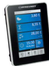
1 Weighing electronics