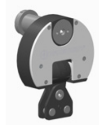
2 Measuring element ASK-2