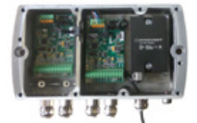
3 Inclinometer in connection box