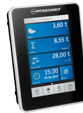
1 Weighing electronics