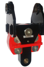
2 Measuring element BGW-1