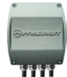
3 Inclination measuring system