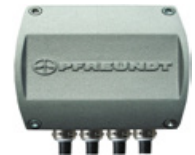
3 Inclination measuring system