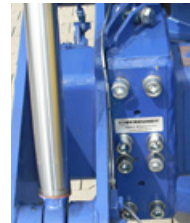
2 Measuring element FLW-1