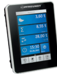
1 Weighing electronics