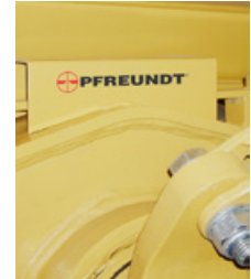
2 Measuring element DW-3