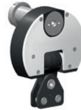
2 Measuring element ASK-2