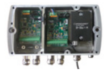
3 Inclinometer in connection box