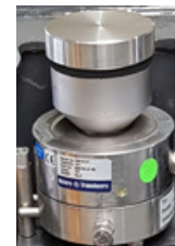
2 Measuring element ARK-2