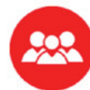
Own installation teams