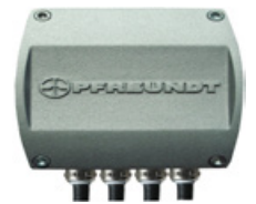
3 Inclination measuring system