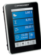
1 Weighing electronics