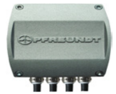
3 Inclination measuring system