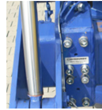
2 Measuring element FLW-1