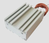
Control cabinet heating