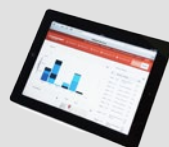
PFREUNDT Web Portal