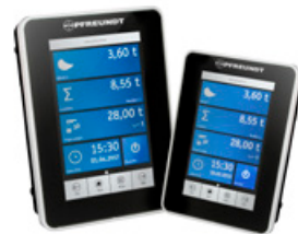
1 Weighing electronics