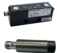
3 Proximity switches