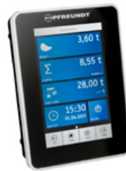
1 Weighing electronics