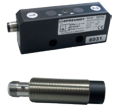
3 Proximity switches