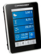
1 Weighing electronics