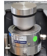
2 Measuring element ARK-2