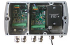
3 Inclinometer in connection box